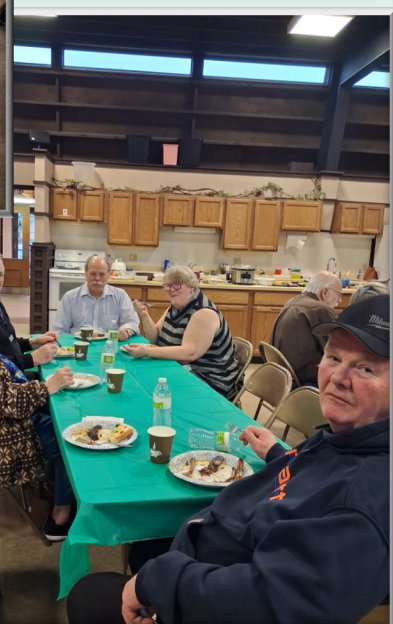
A few photos from our worship service and St. Patrick's Day potluck on March 15th.